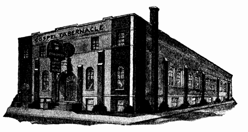
The Fargo Gospel Tabernacle

to the pastor and just as plain to the people. It was not to center around a sermon but the Spirit; not preaching but praise. Dogma was to become Doxology. The pastor was certain that it was to be a revival with an empty pulpit. How silly it seemed! How could the church dispose of its pastor for even one service? 'Twas absurd to have a revival campaign without a preacher! The pulpit has always played a remarkable part in every revival. Yes, maybe. However, not such a large part on the day of Pentecost. Have you noticed that? Perhaps more Spirit and less pulpit might solve some of our pressing problems in some of our Pentecostal and other churches too. If you think this is absurd, what would you think if I told you that it was certain on this first Monday night that not only was this to be a revival with